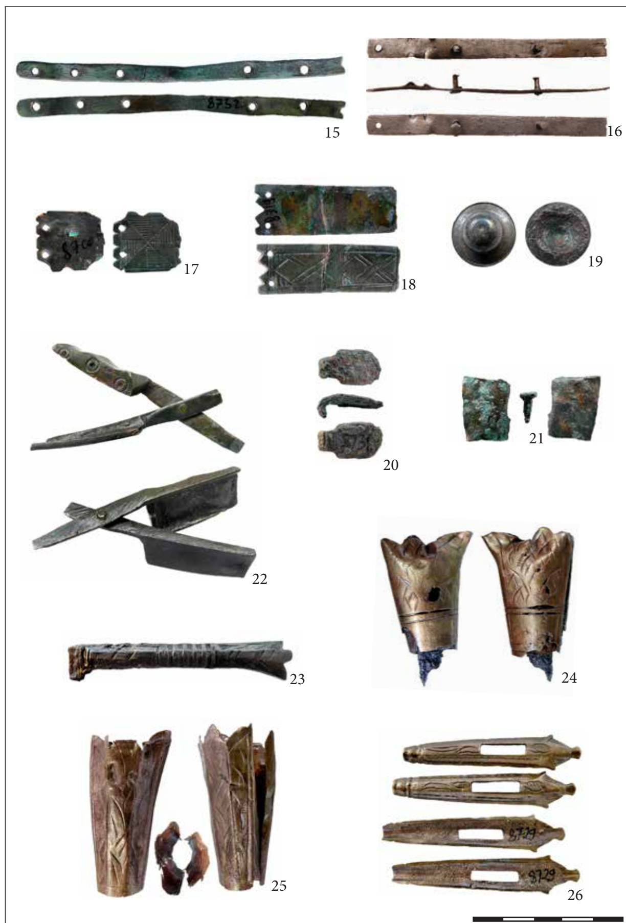
Plate 2. Bronze objects from Târgu Mureș–Franciscan Friary.