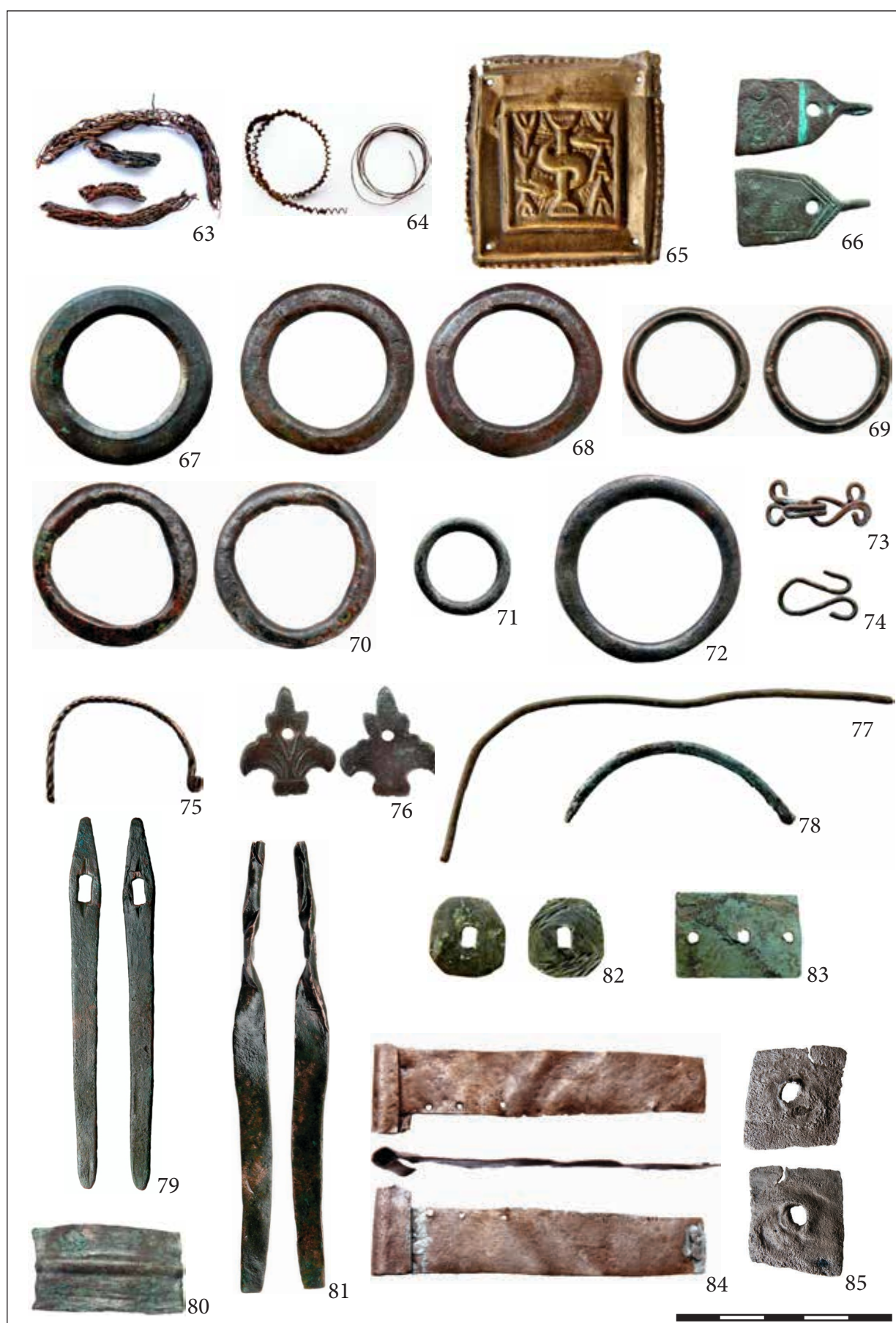
Plate 6. Bronze objects from Târgu Mureș–Franciscan Friary.