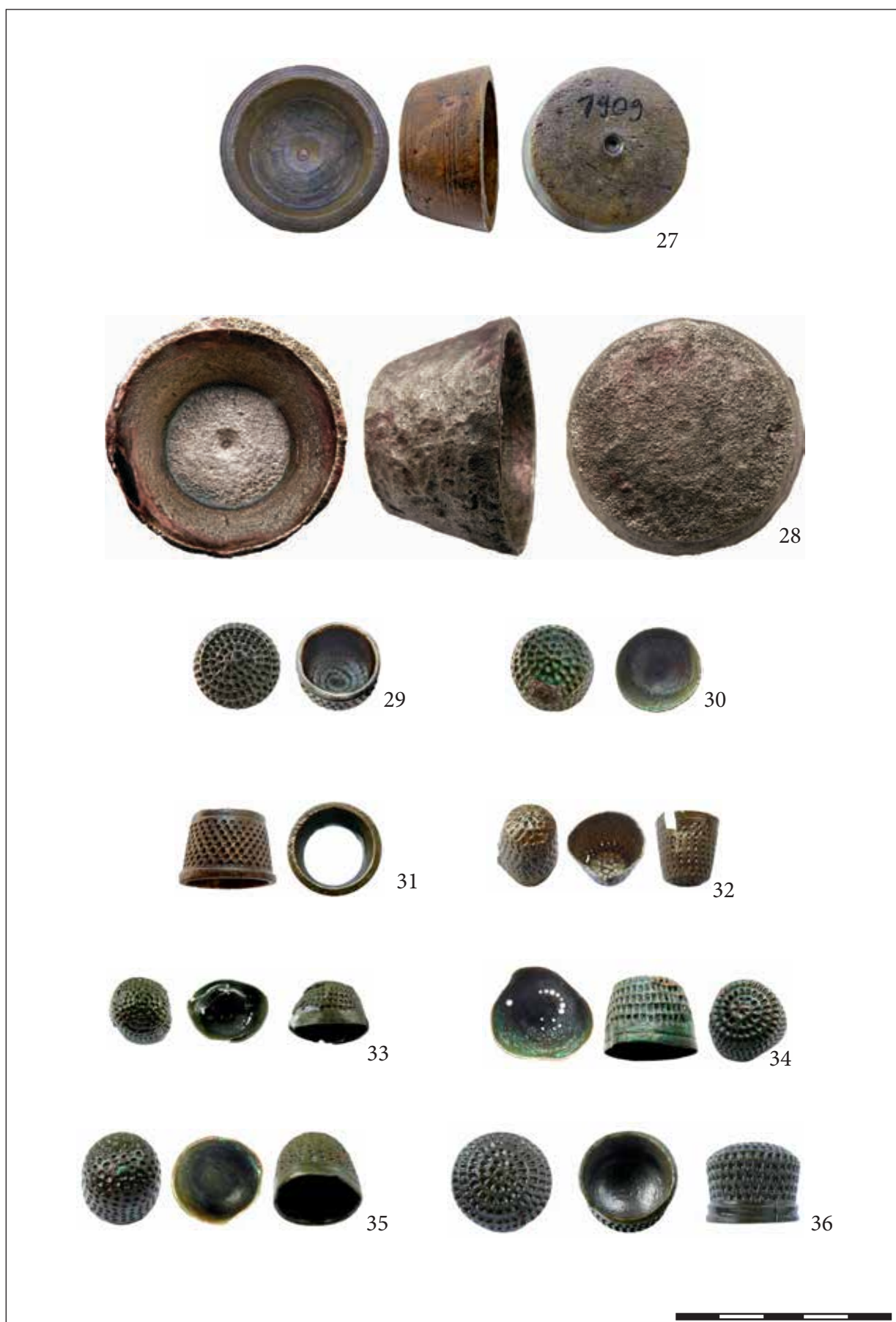
Plate 3. Bronze objects from Târgu Mureș– Franciscan Friary .