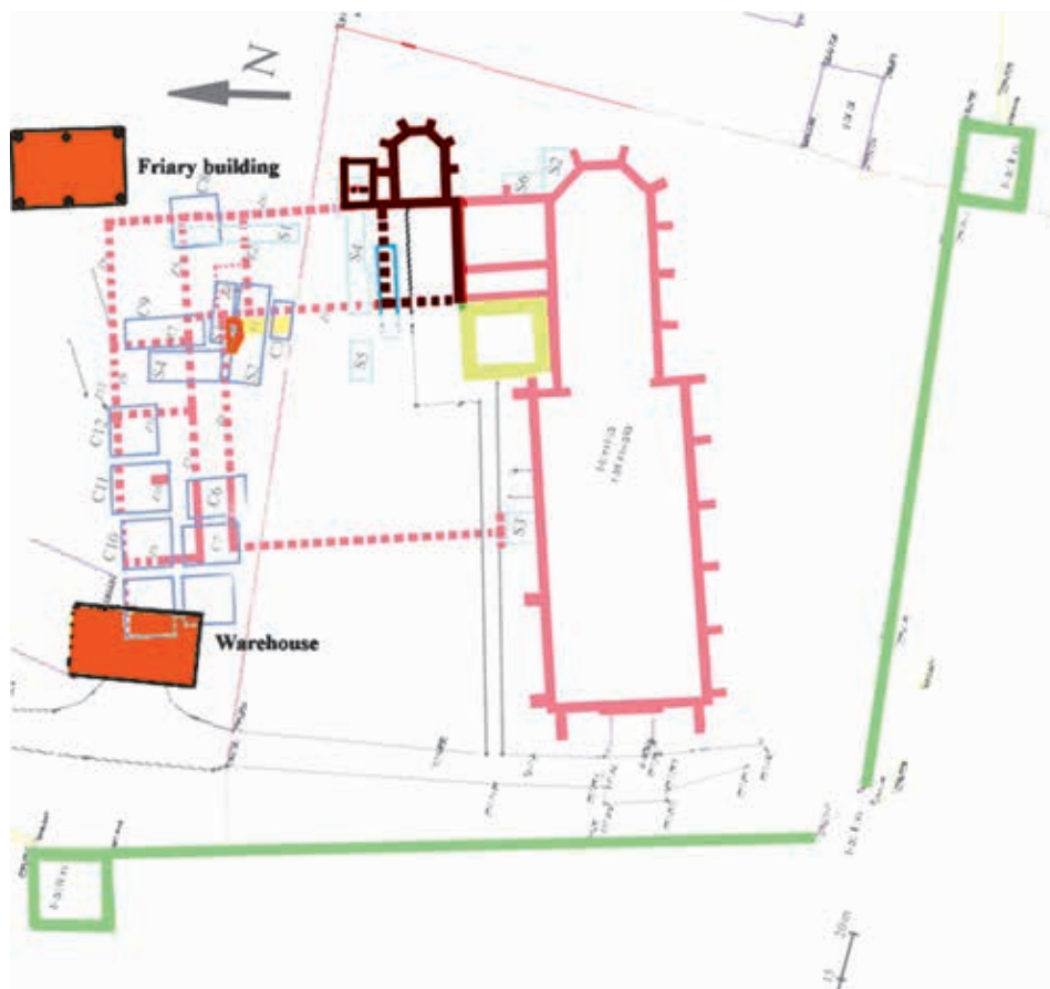
Fig. 2. The ground plan of the 14 th century friary with the wooden buildings.