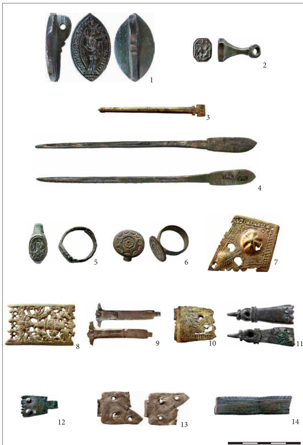
Plate 1. Bronze objects from Târgu Mureș–Franciscan Friary.