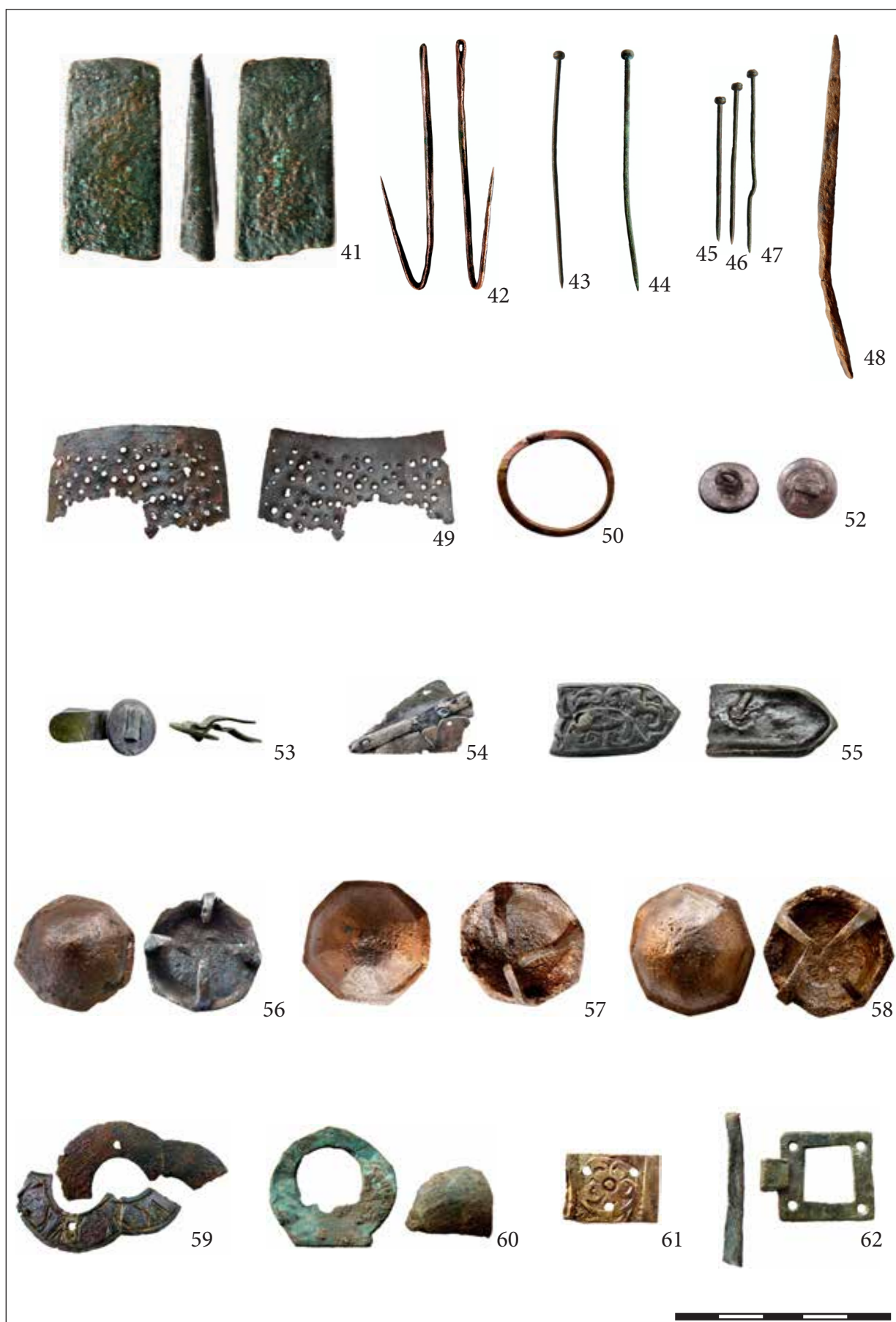
Plate 5. Bronze objects from Târgu Mureș– Franciscan Friary .