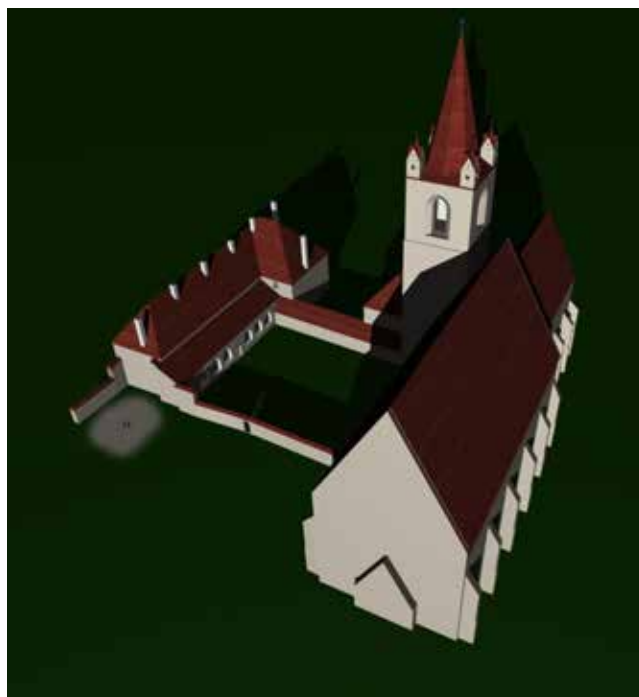
Fig. 1. The reconstruction of the Franciscan friary based on the results of the archaeological excavations and on the existing analogies (by Gergely Buzás).

The first identified wooden building was the L1. In 2005 the north-western corner of the 15 th century friary was researched and instead of the later friary structures the foundation of the northern wall and a small plaza paved with stone was identified. The northern wall was longer than the friaries' courtyard (Fig. 1), probably the Franciscans planned the construction of a western wing as well but for unknown reasons this never happened. Nevertheless, below the plaza marked with the gray colour the traces of an earlier wooden building were identified that was destroyed in a fire. The site of L1 was excavated in 2005–2007 (Fig. 2). The wooden building's floor was dug in the yellow clay, the eastern side was 1 m deepened in the soil while its western side was on the edge of the hill. The pit of the former building was filled up with the garbage resulted