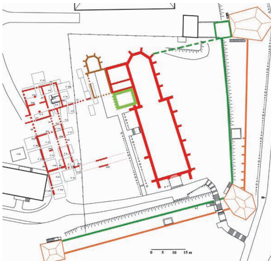
Fig. 3. The fortified Franciscan friary at the late 15 th century.